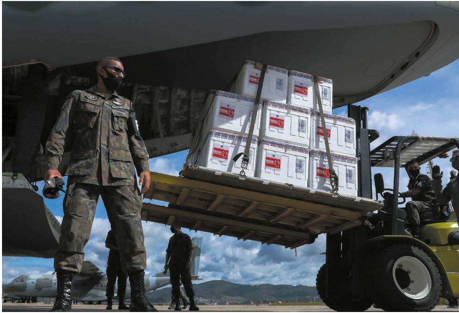
Brazil began widespread distribution of Sinovac Biotech's CoronaVac vaccine in January.